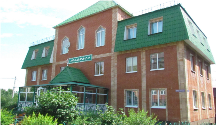
The Gabdulla ibd Masgud Madrassa in the city of Mamadysh.