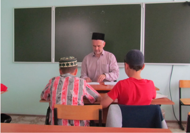
Arab language lesson during summer camp at the madrasa in the city of Kukmor. Author's photo, 2017.

Bayram ) or Ramadan ( Gaid/Id ), with abundant meals as well as different contests for children in various aspects of Islamic culture including reciting the Qur'an or knowledge of the basics of Islam.