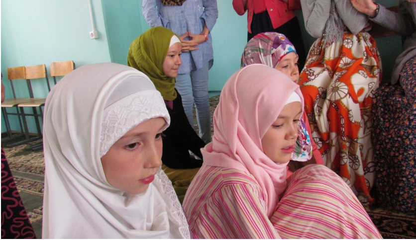
Summer camp at the madrasa in the city of Kukmor (a group of girls).

Another example of children's Islamic education is the unique Muslim private school of Usmaniya, which offers eleven years of education. The Muslim Religious Board of the Republic of Tatarstan founded this institution. The program includes Arabic language and in the afternoon, children study in the nearby mosque of Nur al-Islam, where courses on the history of Islam, the history of the prophets, and reading and memorizing the Qur'an are taught. There are about a hundred children studying there.